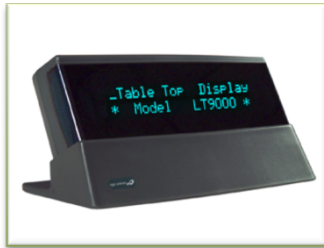
Customer Counter Top Display