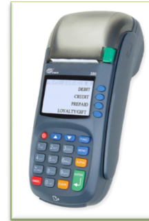
Pax S80 Terminal