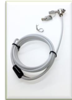
Security Locking Cable